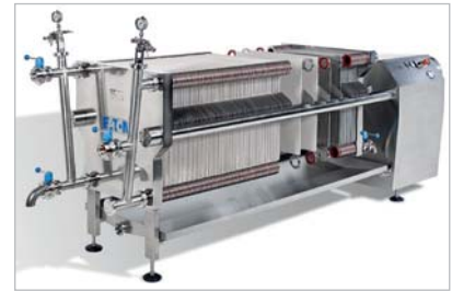
Plate and frame filtration systems are a proven means of removing Alicyclobacillus acidoterrestris bacteria and its spores that cause product spoilage in fruit juice production. Using the BECO COMPACT PLATE A600 filtration system, a large juice concentrate manufacturer was also able to tackle leaks: a significant problem with multi-sheet filters. Thanks to its high pressure tightening and automatic re-tightening, the filtration system not only reduces drip loss to a minimum, it also increases the efficiency and cost-effectiveness of the entire process ...

An immaculately clean solution – Multi-sheet filter not only removes ACB, it also minimizes drip loss . . . . 300